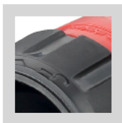
插头锁紧标识 Symbol of locked plug