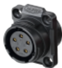
YM-20-J05SX-01-001 母座 female socket