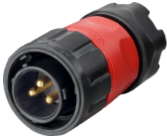
YM-20-C03PE-01-001 公头 Male plug