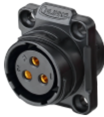
YM-20-J03SX-01-001 母座 Female socket