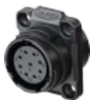
YM-20-J09SX-01-001 母座 female socket