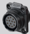
YM-20-J12SX-01-001 母座 female socket