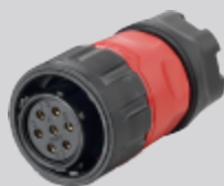
YM-20-J07PE-01-001 母头 female plug