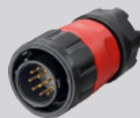
YM-20-C12PE-01-001 公头 male plug