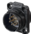
YM-20-C09SX-01-001 公座 male socket