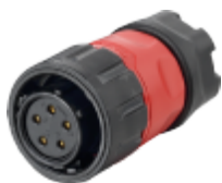
YM-20-J05PE-01-001 母头 female plug