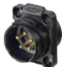
YM-20-C05SX-01-001 公座 male socket