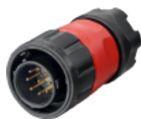
YM-20-C09PE-01-001 公头 male plug