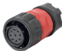
YM-20-J09PE-01-001 母头 female plug